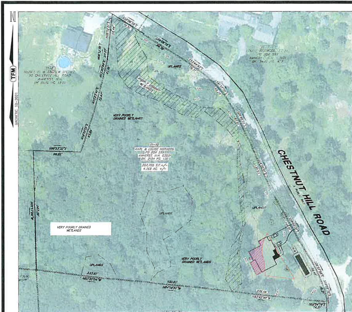
OVERALL SITE PLAN