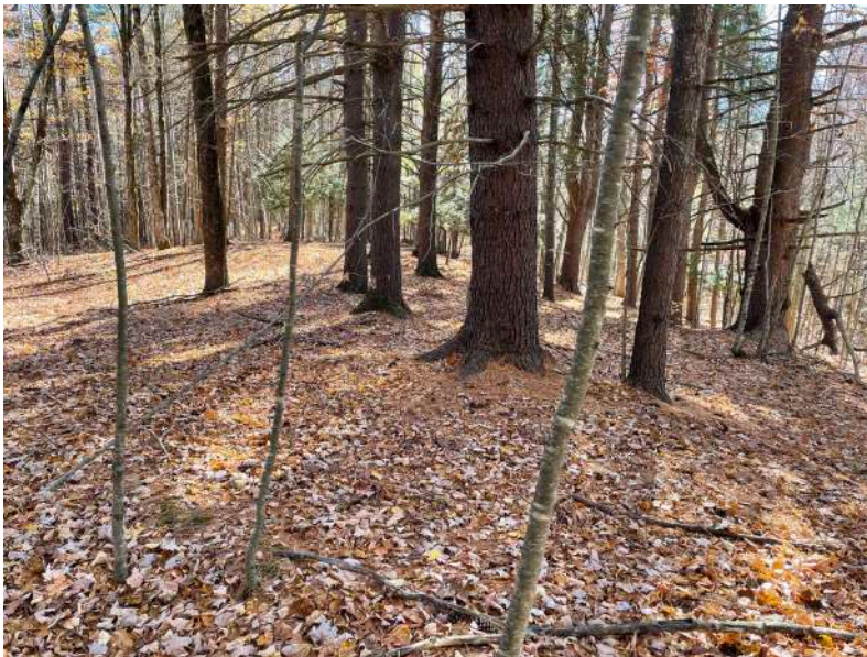
Photo 16 10/25/2024 Lot 5-100 along ridge