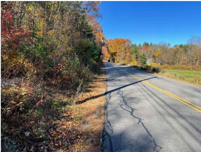
Photo 6 10/25/2024 Christian Hill Road facing southeast