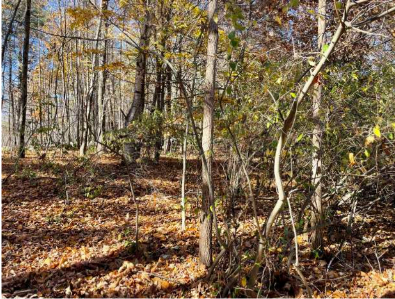
Photo 13 10/25/2024 Lot 5-100 facing north along stonewall