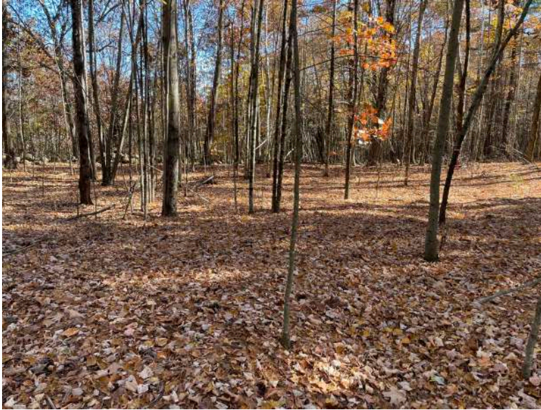
Photo 15 10/25/2024 Lot 5-100 along ridge