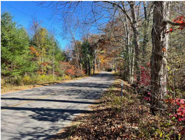
Photo 10 10/25/2024 Christian Hill Road facing southeast