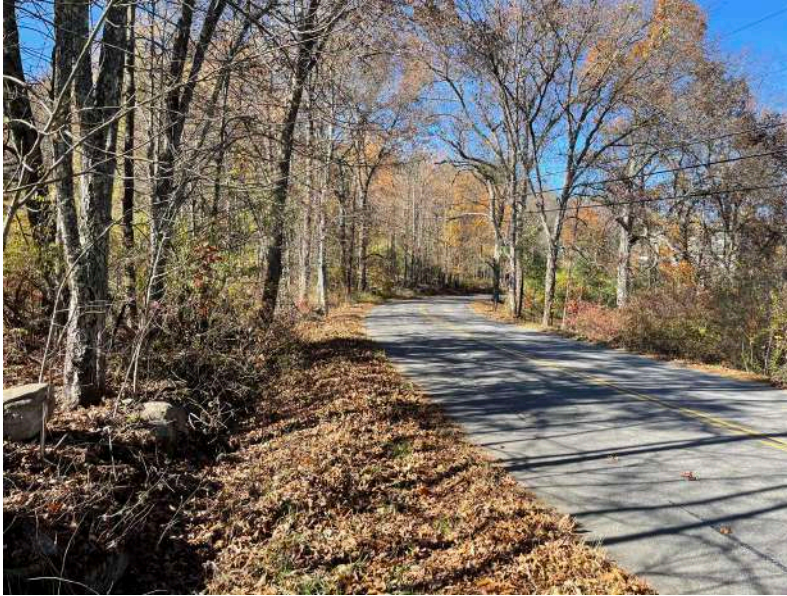
Photo 9 10/25/2024 Christian Hill Road facing northwest