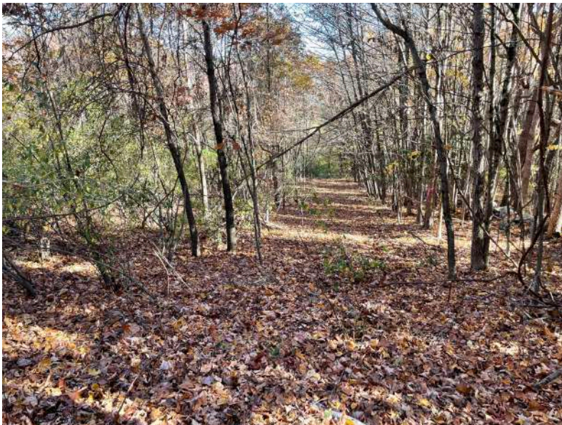
Photo 14 10/25/2024 Lot 5-100 facing east along stonewall