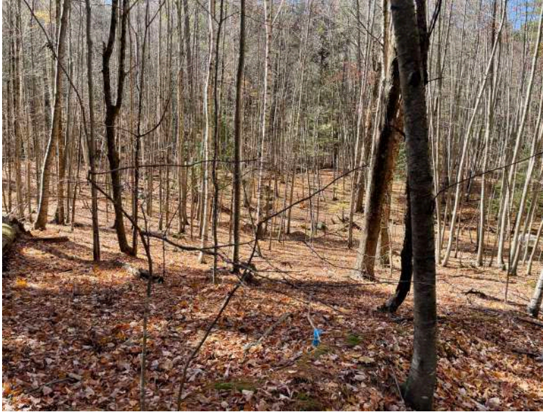
Photo 17 10/25/2024 Lot 5-100 along ridge