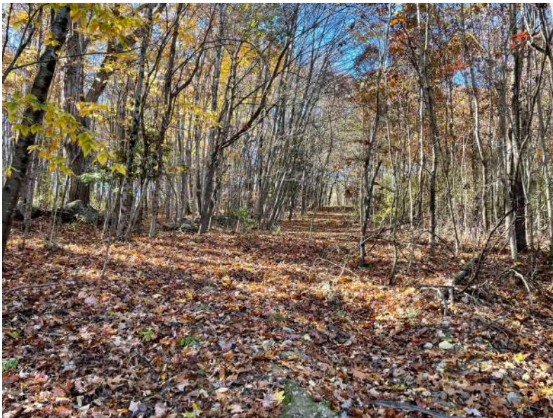
Photo 12 10/25/2024 Lot 5-100 facing southwest along stonewall