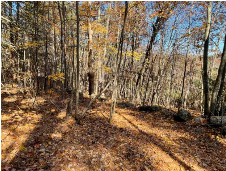
Photo 18 10/25/2024 Lot 5-100 along ridge