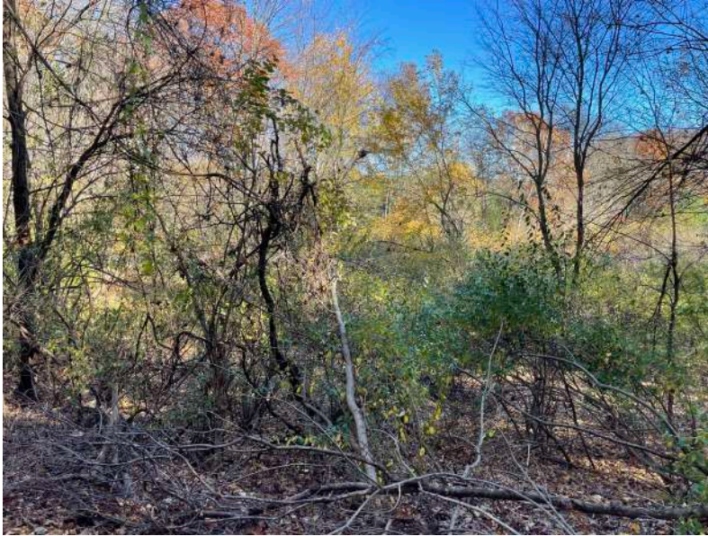
Photo 11 10/25/2024 Lot 5-100 facing north along stonewall