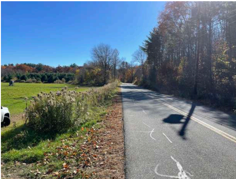
Photo 2 10/25/2024 Christian Hill Road facing Southeast