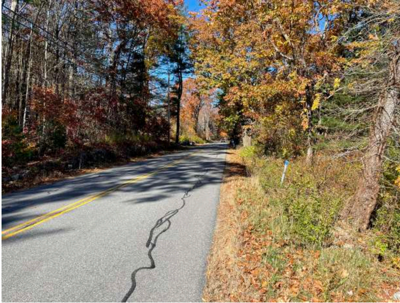
Photo 1 10/25/2024 Christian Hill Road facing northwest