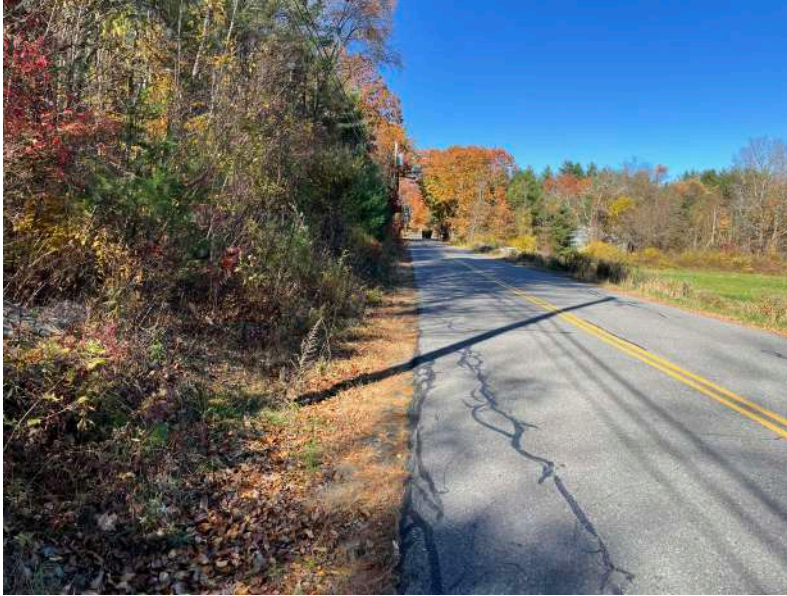
Photo 7 10/25/2024 Christian Hill Road facing northwest