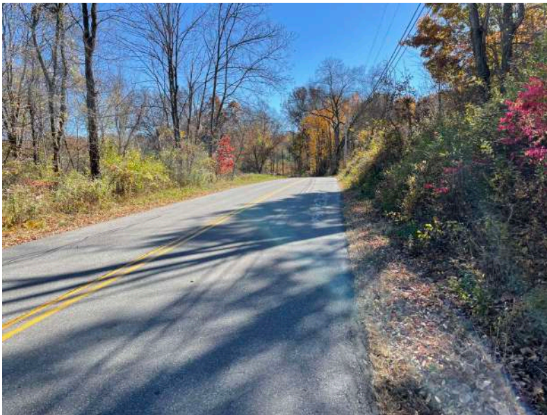
Photo 4 10/25/2024 Christian Hill Road facing southeast