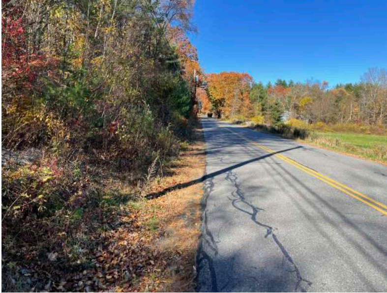
Photo 5 10/25/2024 Christian Hill Road facing northwest