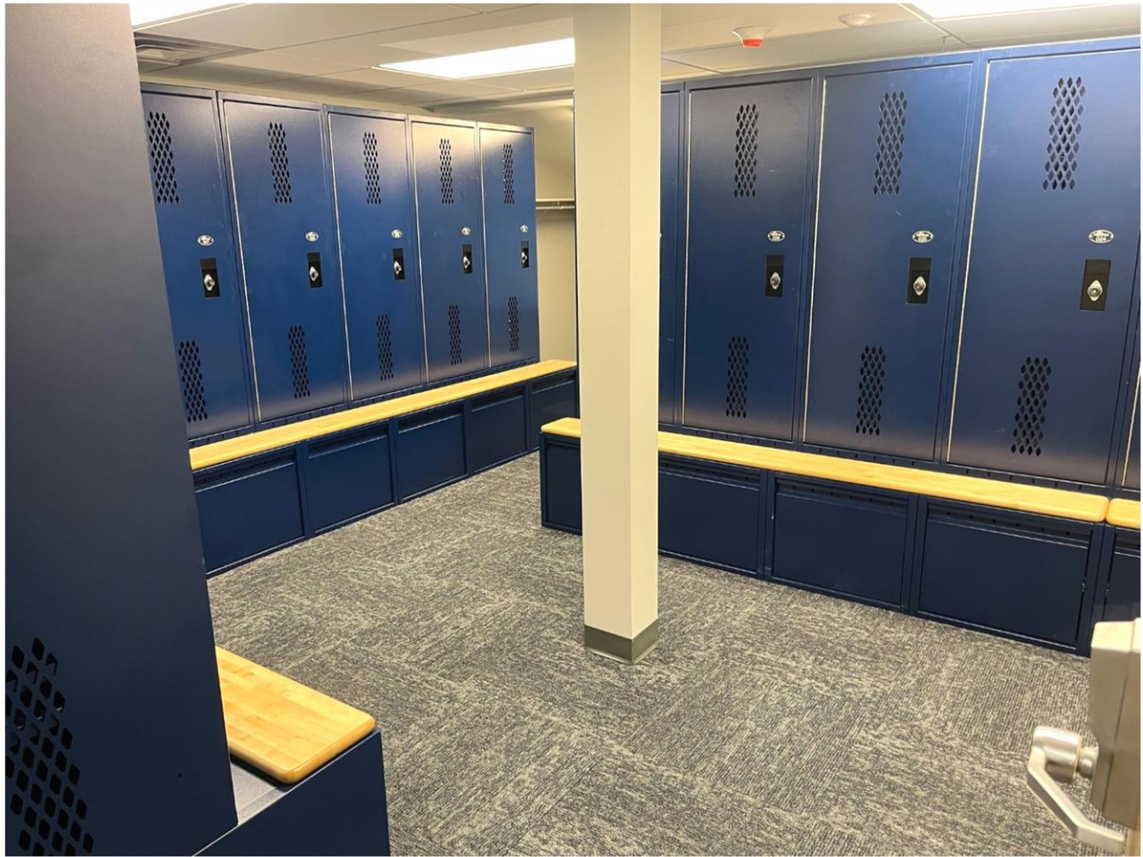
Renovated third floor officer locker room

Alongside infrastructure improvements, the agency's strategic plan over the last two years has focused heavily upon the implementation of a body-worn camera (BWC) system for our officers. The use of BWC's is integral to the Department's vision statement to further enhance transparency and accountability in police work, and has been supported on a state level through the establishment of a BWC grant available to NH cities and towns. The first round of state grant funding for BWC's was made available in February 2022, and the Town has since been awarded the maximum amount of $50,000 to offset BWC expenses. The Department plans to implement this program on or about the start of the upcoming FY24 fiscal year which begins July 1, 2023.