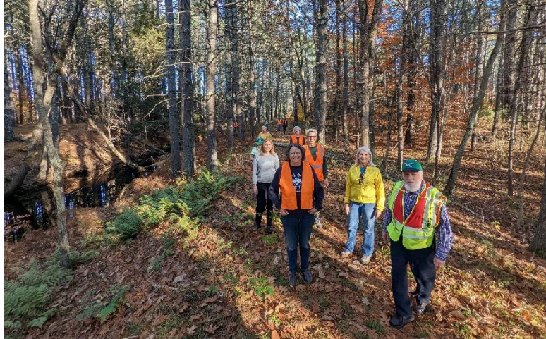
Committee members and regional representatives along the proposed Baboosic Greenway rail trail in 2022

This summer, the Town of Amherst submitted seven projects to the Nashua Regional Planning Commission for consideration for state funding, inclusion in the New Hampshire Department of Transportation's Ten Year Plan , and the listing of projects in federally recognized transportation plans. Six of these projects focused on the continued expansion of the Baboosic Greenway. Each of the Town's submitted projects will now be included in the Long-Range Metropolitan Transportation Plan, increasing the likelihood of future funding from the state.