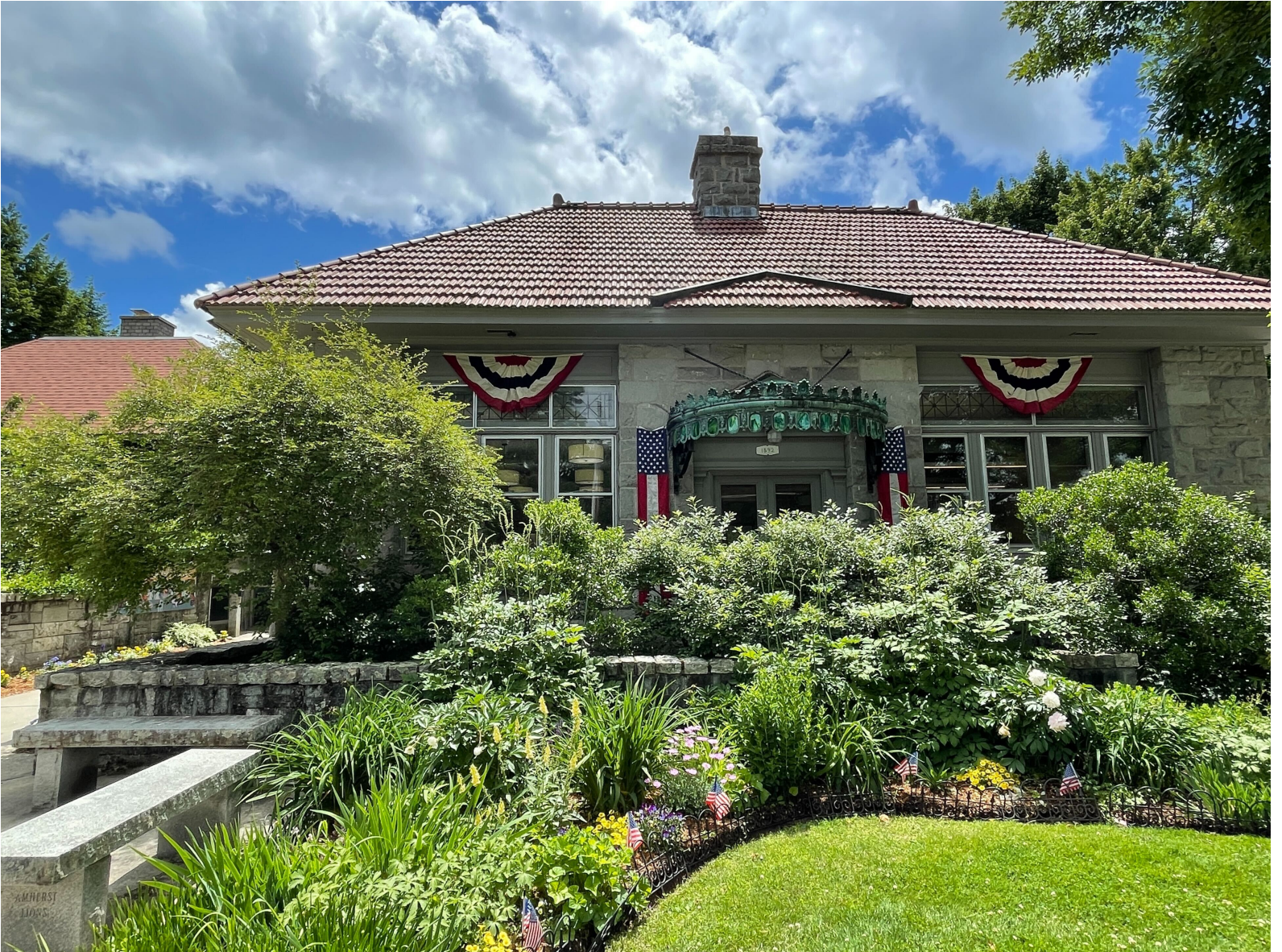
Amherst Town Library, Dressed for the 4th of July